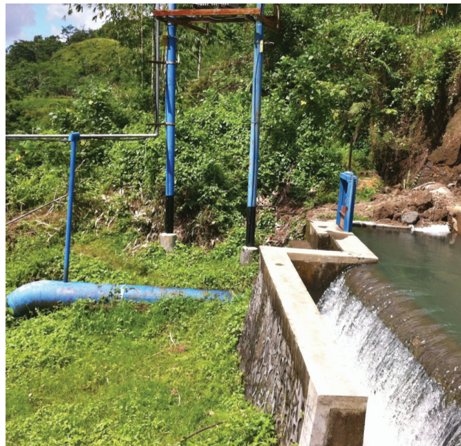
In Lombok Island, water became so stable and abundant that a hydro-power plant provides electricity to hundreds of households.

To date, the ForCES team and their partners completed the stakeholder assessment and ecosystem services mapping of all pilot sites. Project members and communities have been trained to design and select compliance and impact indicators