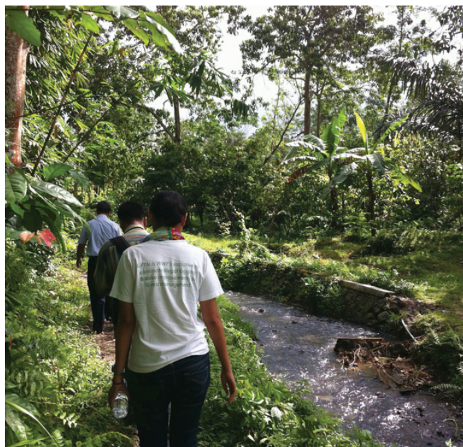
In Lombok Island, smallholders are planting fruit trees in the buffer zones around the river.